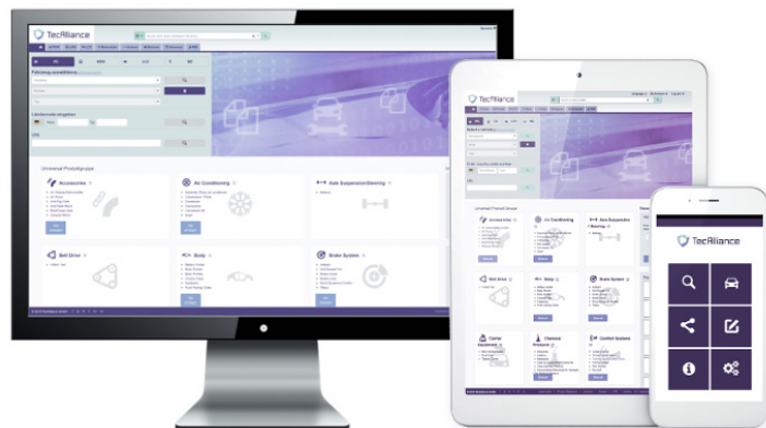
TecDoc Catalogue - TecAlliance GmbH

Apart from companies looking for replacement parts, TecAlliance targets suppliers listed in the catalogue system. The aim is to optimize their catalogue with both groups in mind, so they can meet their users' needs and advise suppliers on the most effective product placement.